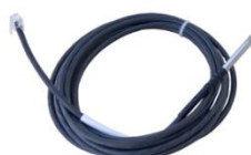
Temp-1Wire-Outdoor 3m 600 311