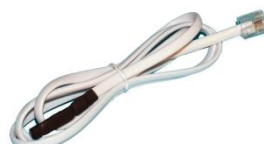
Temp-1Wire 1m 600 242