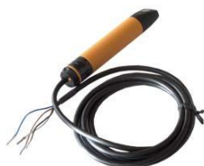
AirFlow detector 5101 600 304