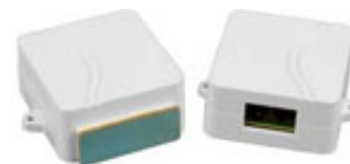
HTemp-1Wire Box2 600 344