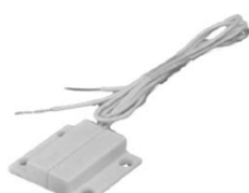
Door Contact 600 119