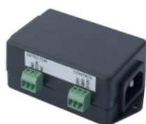
PowerEgg 600 237