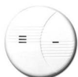
Smoke detector 600 310