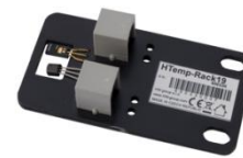
HTemp-Rack19 600 330